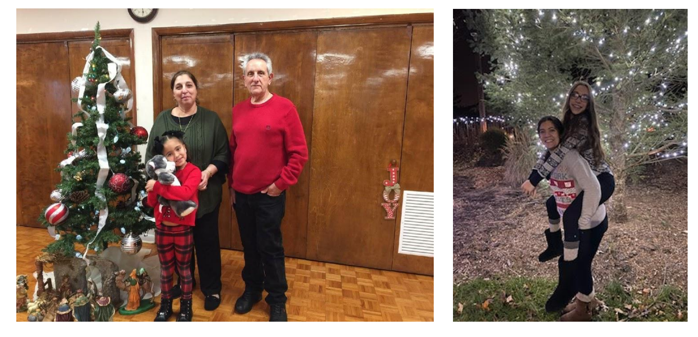
These are the families who submitted their Holiday Photos