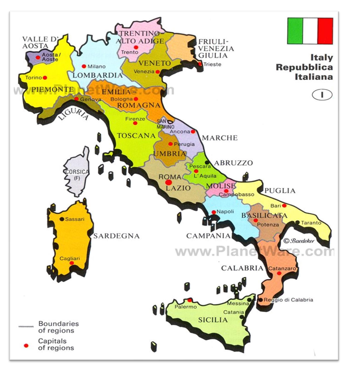
It's "Never Too Late"

We will advertise your business, or your personal ad ~ Only $100.00 See page 7